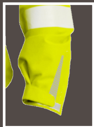
Adjustable hook & loop outer cuffs