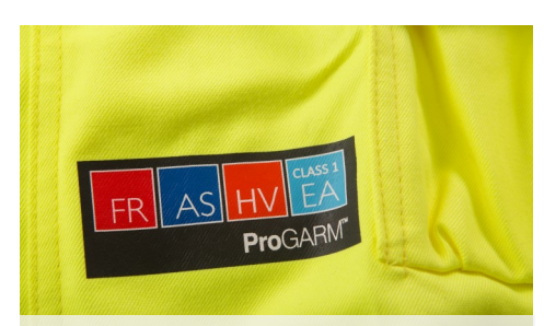
Combat pocket on right leg with SafetyICON™ EN Standard Identification

Colourfast with less than 3% washing shrinkage