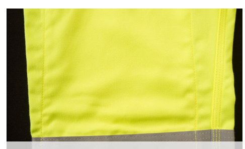
Internal kneepad pocket to fit ProGARM™ 2240 kneepad