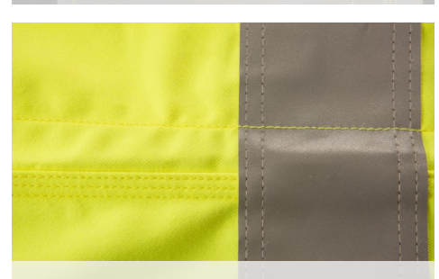
Triple needle stitch seams for extra longevity