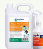
Orange Citrus Degreaser Code: CL4045 3