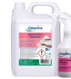
Stain & Odour Eliminator Code: CL4049 4