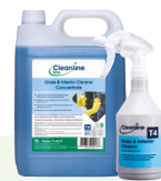
Glass & Interior Cleaner Conc. Code: CL4057 1