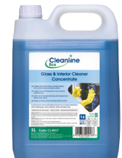
Windows and multi-surface cleaner