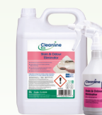
Stain & Odour Eliminator Code: CL4049 4