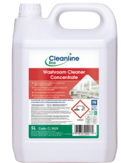
Washroom cleaner disinfectant