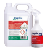
Washroom Cleaner Conc. Code: CL3029 1