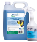
Glass & Interior Cleaner Conc. Code: CL4057 1