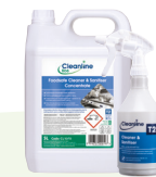
Cleaner & Sanitiser Conc. Code: CL1070 2