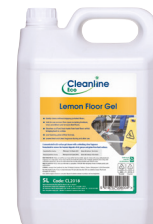
General floor cleaner