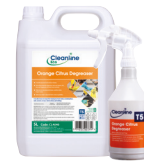
Orange Citrus Degreaser Code: CL4045 2