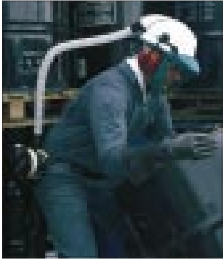
The unique balanced design of the helmet combined with the ease of Tornado respiratory protection, provides a product designed for use in aggressive environments.