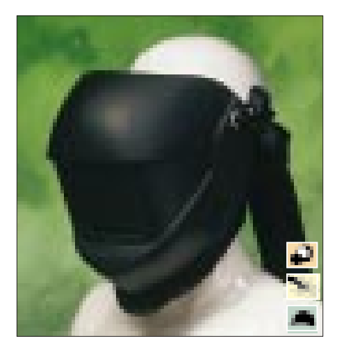
T-Six combines all the features of T-Five with those of T-Four resulting in a product that provides respiratory, impact, head and welding protection with the additional option of hearing protection.