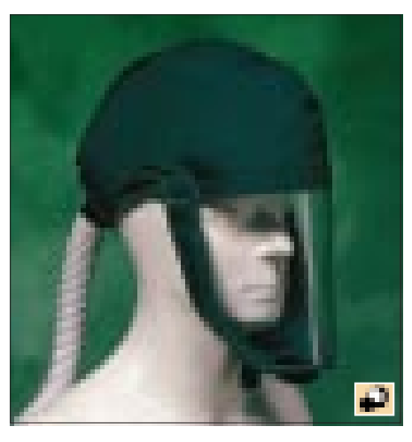
An ultra-lightweight half hood for applications where impact protection is not required. T-One provides a cool flow of air over the head and down the face.