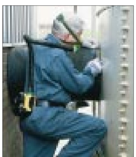
The low profile design of T-Eight makes for easy fitting of visors or welding helmets.