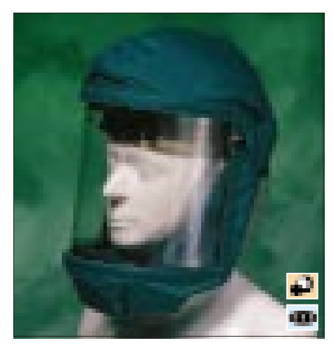
Based on a Browguard providing impact protection certified to EN166, T- Three delivers air to the wearer via a specially designed air duct that directs the airflow to the wearer whilst minimising 'wind in the eyes' discomfort.