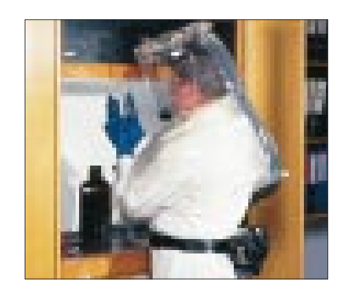
The Respiratory System