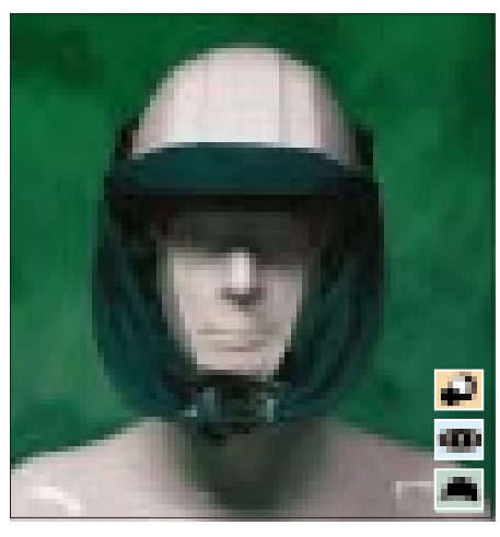
Based on the proven Protector Tuffmaster II helmet, T-Five combines head, face and respiratory protection in one product. There is an additional option for hearing protectors if required.