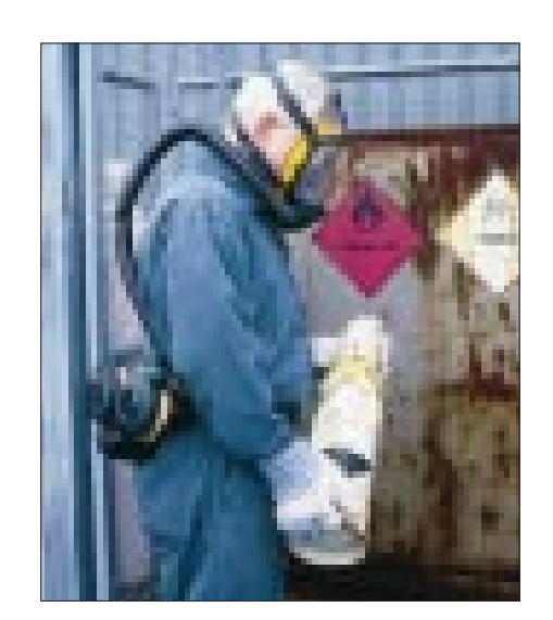
Protector are renowned for their facemasks – and this special liquid silicone rubber version includes all the high specification features of comfort and good field of vision that the market has come to expect.