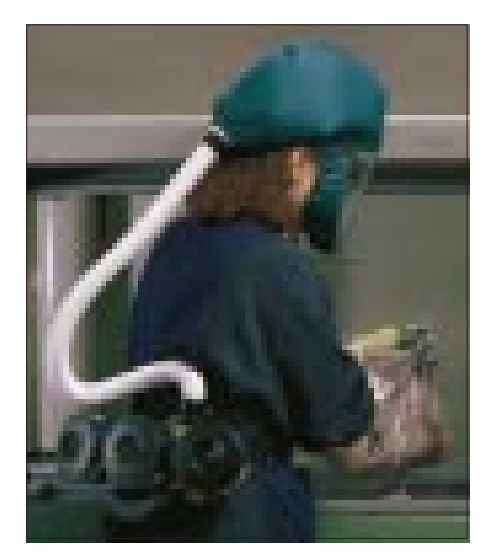
Manufactured from a durable PU coated nylon material, T-One is available in two sizes to ensure a good fit for all wearers.