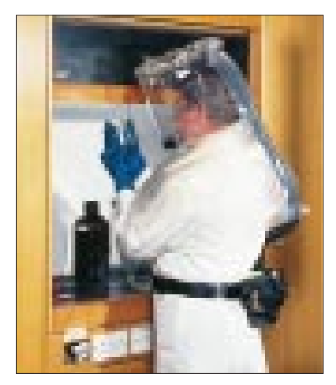
The design of T-Nine makes it suitable for use by wearers who need spectacles or have beards.