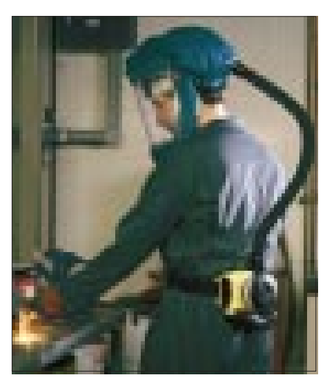
The lightweight T-Three offers a very wide field of vision and the flip up visor is available with screens in a range of materials including those offering protection against molten metal and chemical splash.