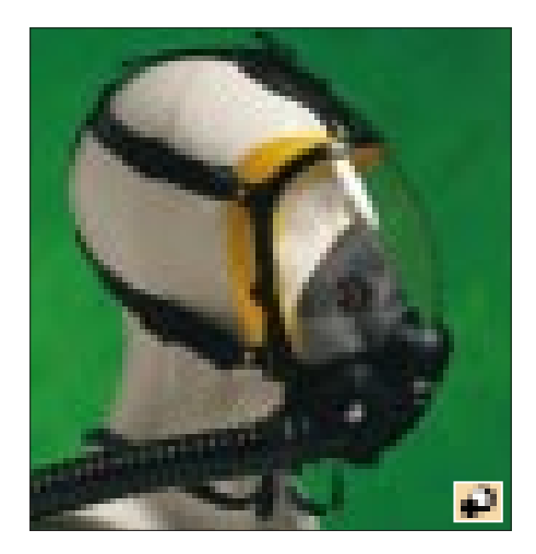
T-Seven is the full facemask version of Tornado providing the highest levels of respiratory protection. A novel hose connection brings the hose up over the wearer's shoulder, keeping the work area clear.