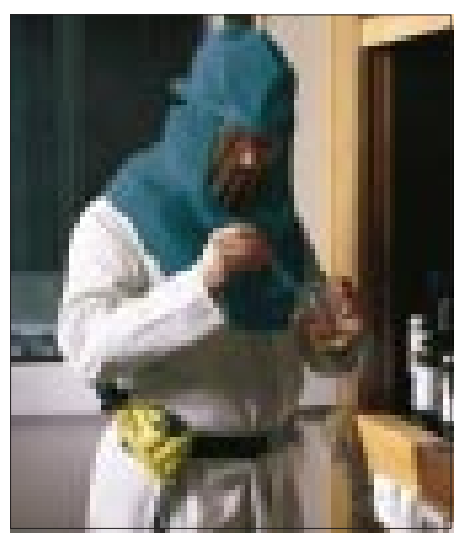
With the convenience of a simple neck tie seal, one size of T- Two will fit all head sizes. It is particularly suited to wearers with beards or spectacles. Optional anti-static version also available in white.