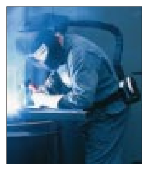
The unique design of the T-Four uses the same air distribution system as T-Three whilst offering maximum operational flexibility and high comfort levels to ensure maximum wearer acceptance.