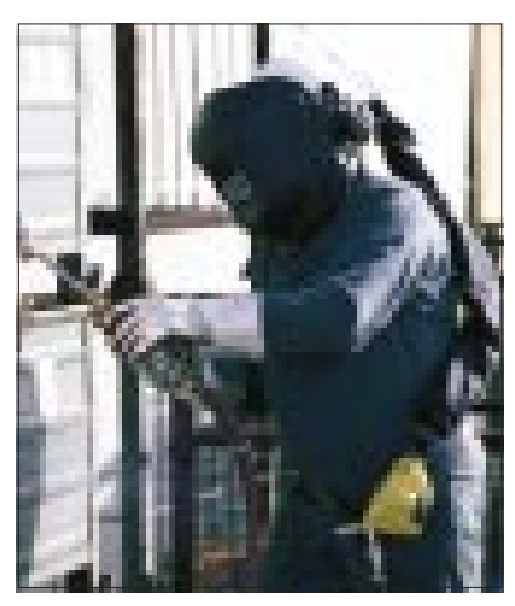
As with T-Four there is a range of welding visors that can be used with T-Six including automatic liquid crystal filters. T-Six provides the ultimate levels of protection for the metal fabrication industry.