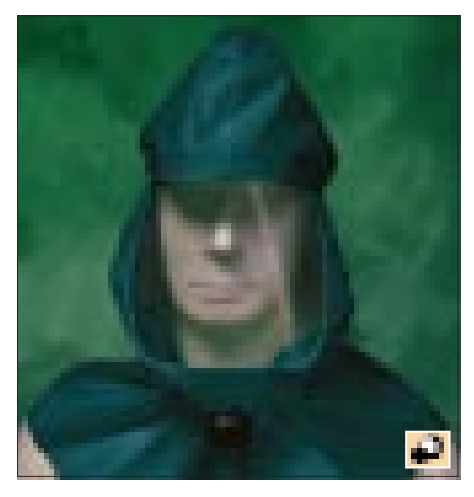
A lightweight full hood manufactured from a durable PU coated nylon material, T- Two covers both the head and shoulders and is for applications where impact protection is not required.