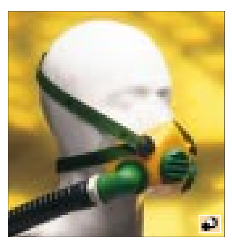
T-Eight is a half mask available in two sizes. The liquid silicone rubber faceseal provides exceptional comfort and fit. Applications include welding and spraying