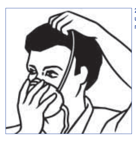
2. Position the respirator under your chin with the nosepiece up.

For callers within the Republic of Ireland 1800 320500.