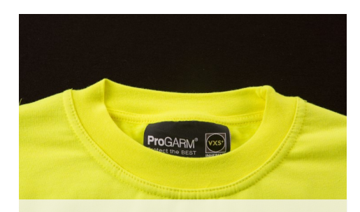
Twin needle stitch on neckline