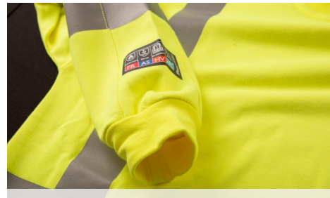
Rib knit cuff with Lycra for comfort and close