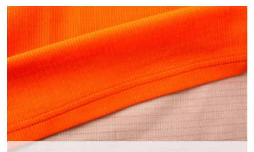
Ultra-soft and durable VXS+ Fabric