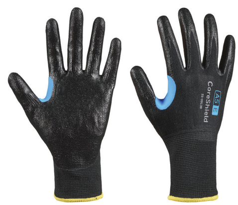
CoreShield<sup>™</sup> Cut protection made simple

With CoreShield<sup>™</sup>, simplified hand protection is at your fingertips.