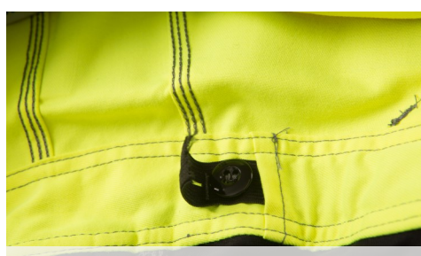
Internal elasticated waistband for improved fit