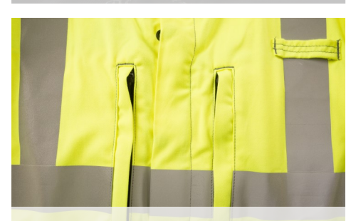
Vertical chest pockets for use with harnesses