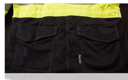
Combat pocket on right leg with phone pocket

Colourfast with less than 3% washing shrinkage