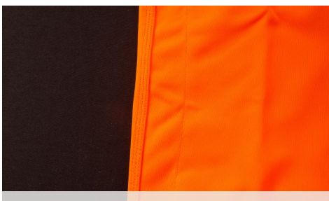
Internal kneepad pocket to fit ProGARM 2240 kneepad