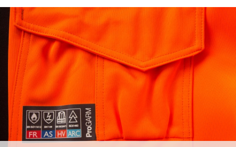
Combat pocket on right leg with SafetyICON EN Standard identification

Colourfast with less than 3% washing shrinkage